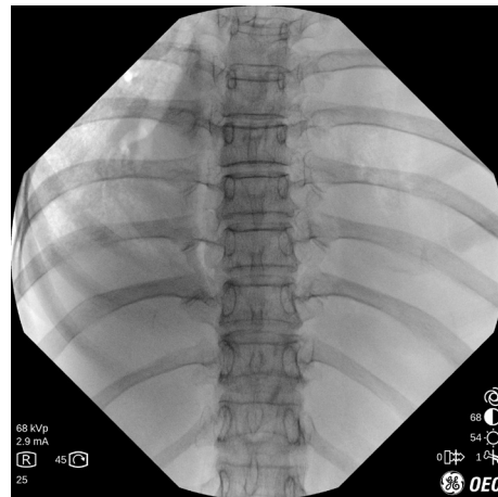
AP spine – Diamond View