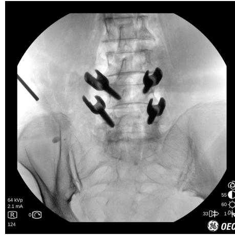
Spine with pedicle screws