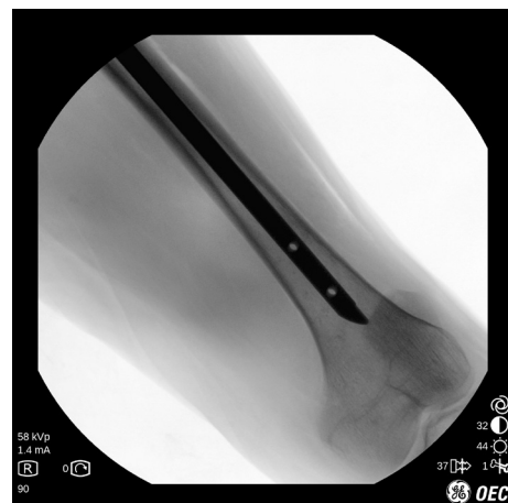
Intramedullary nailing of femoral bone