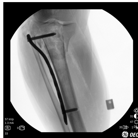
Lower leg plate and screws